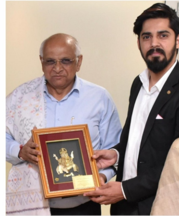
SHRI BHUPENDRA PATEL (Chief Minister of Gujarat)