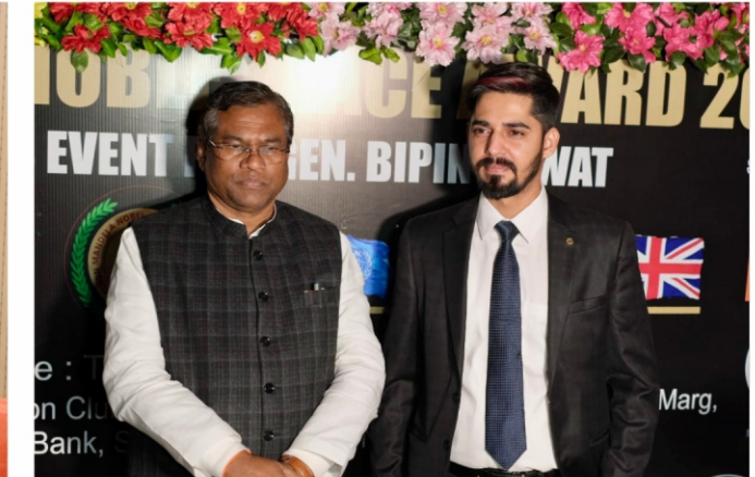
FAGGAN SINGH KULASTE (Member of State for Rural Development of India)