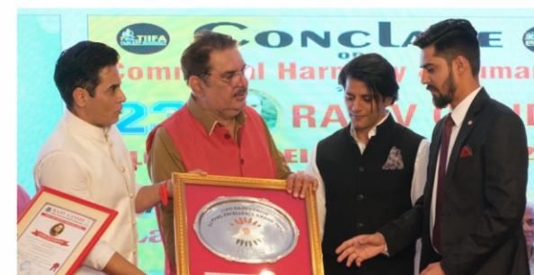
23 RD RAJIV GANDHI AWARD CEREMONY