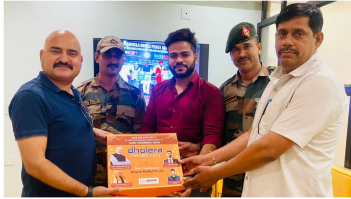
CO DEFENSE ARMY OFFICER (COMMANDING OFFICER)