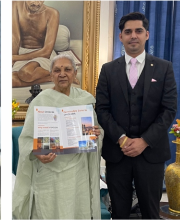
SMT. ANANDIBEN PATEL (Governor of Uttar Pradesh)