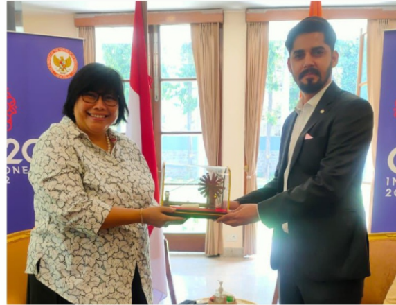
AMBASSADOR OF INDONESIA (Embassy of the Republic of Indonesia, New Delhi)