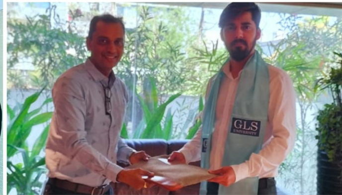
FACILITATE BY GLS UNIVERSITY