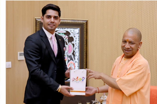
YOGI ADITYANATHJI (23RD Chief Minister of Uttar Pradesh)