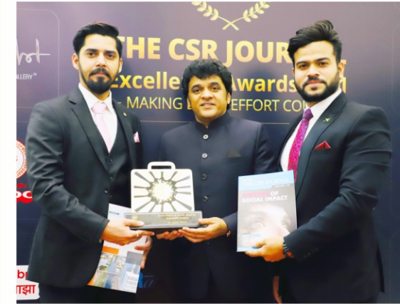
CSR - JOURNAL AWARD CEREMONY