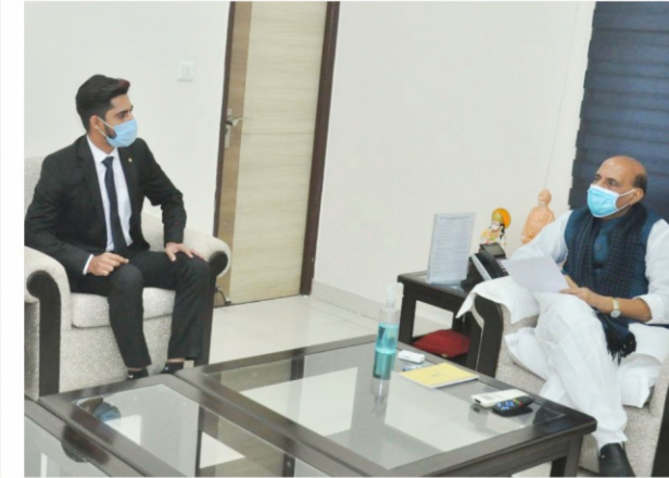
SHRI RAJNATH SINGH (Defence Minister)