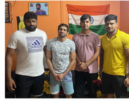
SUMIT MALIK (FREESTYLE WRESTLER)