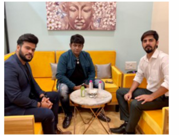
VIP @BROGHAR OFFICE