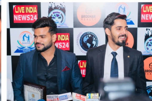
MEDIA INTERACTIONS (DELHI)