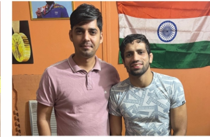
RAVI KUMAR DAHIYA (INDIAN FREESTYLE WRESTLER)