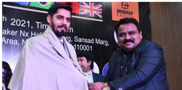
BNI - AHMEDABAD