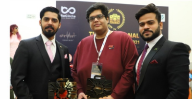
TANMAY BHAT (ACTOR, COMEDIAN & YOUTUBER)