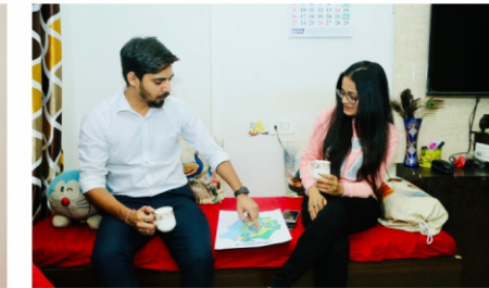
DOLPHIN DUBEY (INDIAN ACTRESS)