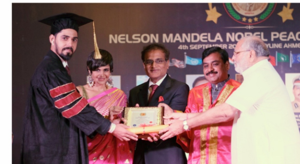
MANDIRA BEDI (INDIAN ACTRESS)