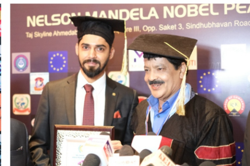
UDIT NARAYAN (SINGER)