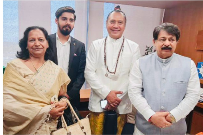
MR. RAJENDRA TRIVEDI (Law & Revenue Minister)