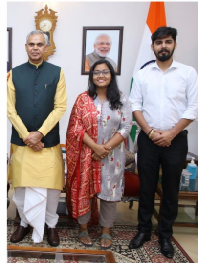
ACHARYA DEVVRAT (GOVERNOR OF GUJARAT)