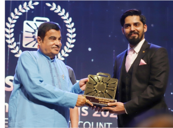
SHRI NITIN GADKARI (Minister of Road Transport & Highway of India)