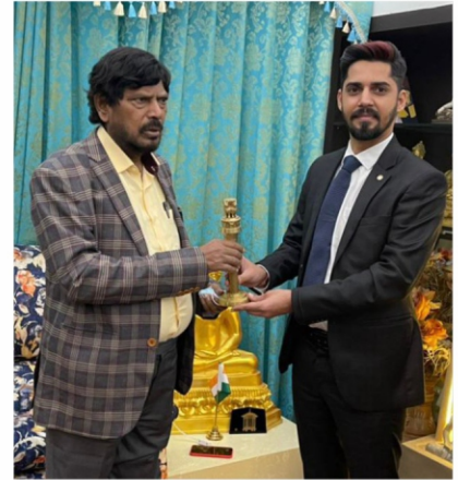
RAMDAS ATHAWALE (Minister of Social Justice & Empowerment of India)