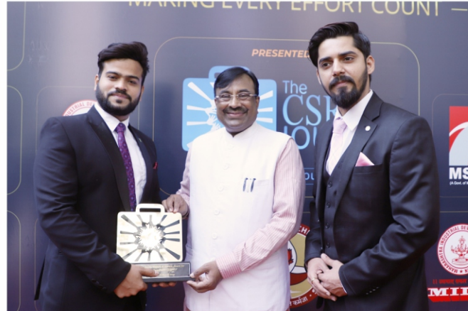
SHRI SUDHIR MUNGANTIWAR (Member of the Maharashtra Legislative Assembly)