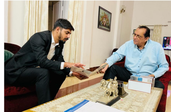
MR. FRANCISCO SARDINHA (Ex. Chief Minister of GOA)