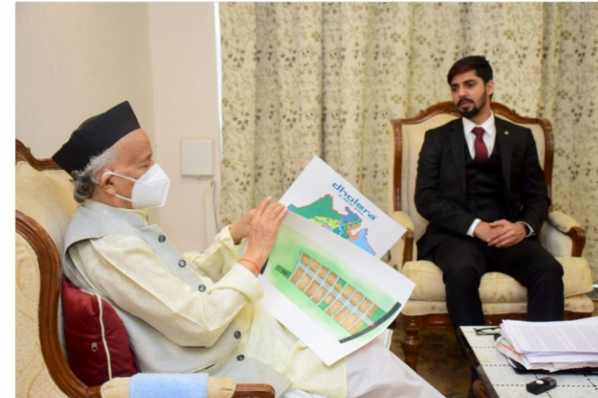
BHAGAT SINGH KOSHYARI (Governor of Maharashtra)