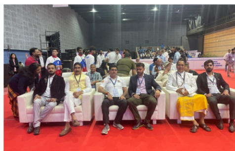
2 ND NATIONAL YOGASANA SPORTS CHAMPIONSHIP(SENIOR)