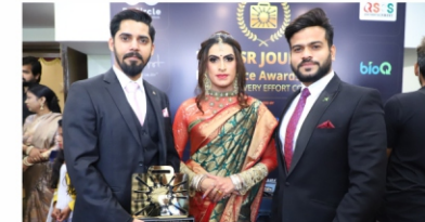
SUSHANT DIVGIKAR (MODEL, ACTOR, SINGER)