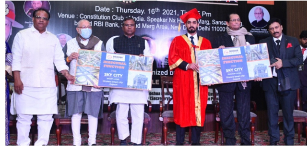
INAUGURATION FUNCTION OF SKY CITY