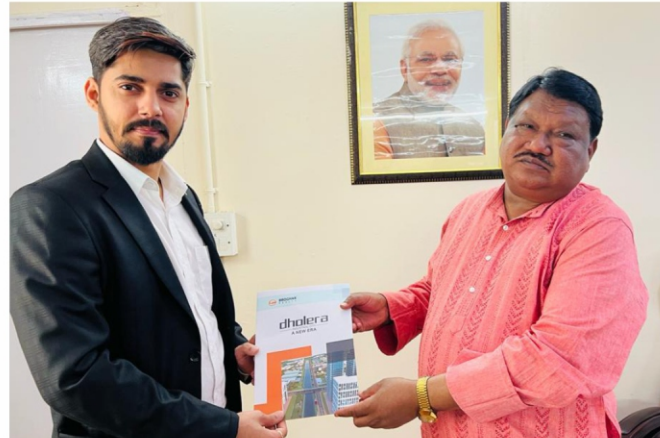
MR. JUAL ORAM (Member of Lok Sabha)