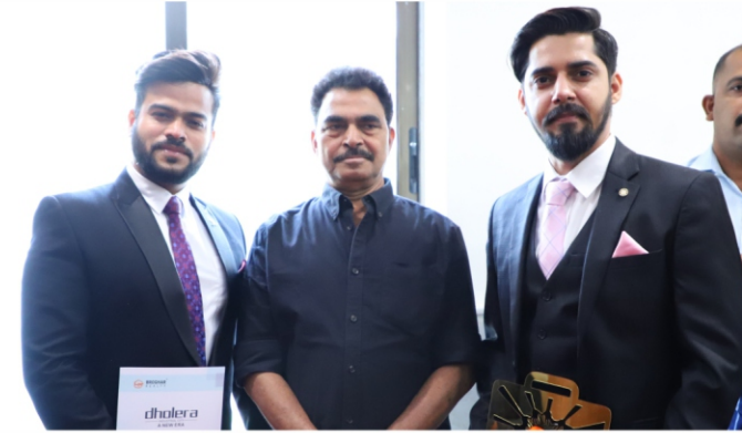
MR. SAYAJI SHINDE (ACTOR & PHILANTHROPIST)