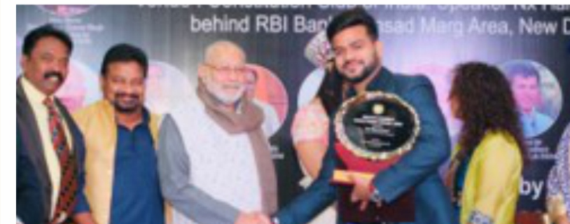
NELSON MANDELA NOBLE PEACE AWARD 2021